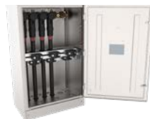
JUNCTION BOXES UP TO 36 KV