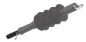
COLD SHRINK TERMINATIONS UP TO 42 KV