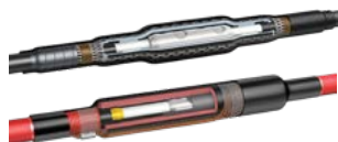
HEAT & COLD SHRINK JOINTS UP TO 42 KV