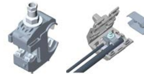
INSULATION PIERCING CONNECTORS WITH GEL COVER

Reduce overall labor, operational and maintenance costs with our Customizable Trunk Solution. Designed to eliminate combiner boxes and provide plug-and-play flexibility.