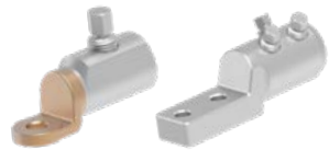
SHEAR BOLT LUGS

Our range of lugs and sleeves, dual-rated or bimetallic, accommodate aluminum and copper conductors with no torque maintenance required.