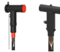
SEPARABLE CONNECTORS UP TO 42 KV

Our Raychem separable connectors and cold shrink terminations are easy to install, compact and adaptable to most cable types to reduce your installation time and costs.