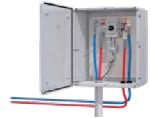
DISCONNECT TRUNK BOXES