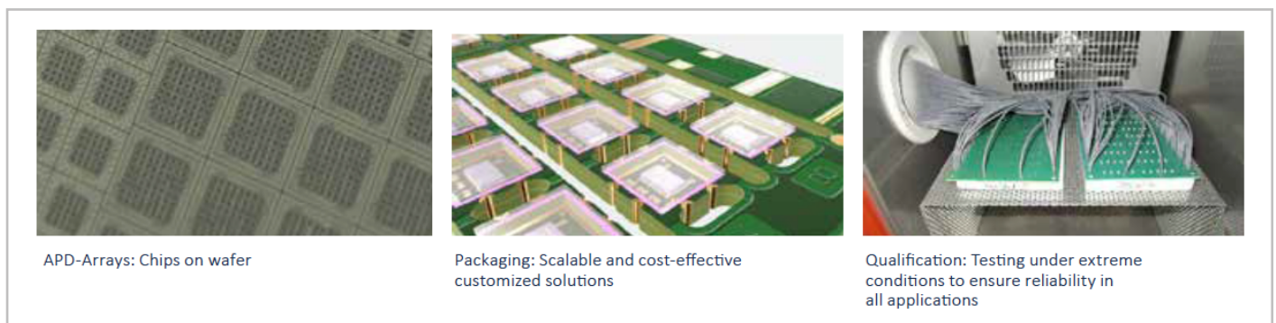
Figure 3 APDs

Basically, when done right, they combine proven performance with an attractive price. Currently the detectors of choice for automotive long-range LiDAR, APDs are critical components in a number of today's most advanced mobility systems.