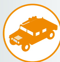
Light Military Vehicles