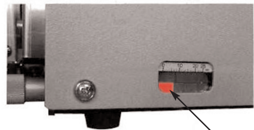
Partial Strip Indicator